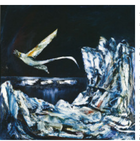
of 1964, oil on hardboard. Private collection © The Trustees of the Sidney Nolan Trust

Draw this bird flying into a very different, hotter scene.